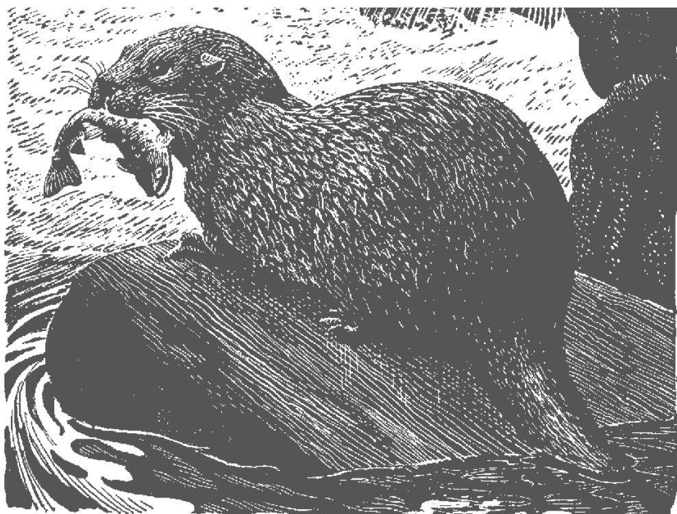
Otters are making a comeback in local rivers and reports of sightings along the River Bourne have been noted.

Cross the stile and follow the track with the fence on your left. To your right is a railway embankment and the River Bourne, which feeds into Shustoke Reservoir. Continue along the footpath, past the edge of the reservoir and over the brick bridge. Progress along the path to the railway line. Turn left and go through the gate following the path between the hedge and the railway line. Continue past the Reservoir and the tunnel on your right hand side.